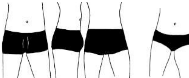
Minimum coverage for Male shorts